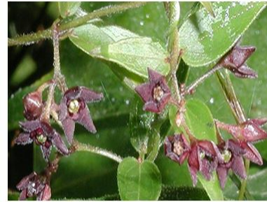
Pale swallow-wort flowers, deadly to Monarchs

The club also ordered 1,500 daffodil's bulbs that were given out to club members and also the DeWitt community at our October Farmer's Market. The left-over bulbs will be planted by DMGC members around the new city hall.