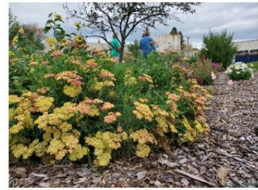
Look at how big and beautiful the Yarrow has gotten

Brighton Garden Club's Perennial Garden welcomes you into the Gleaners Food Bank Victory Garden. Volunteers for both gardens get a treat.