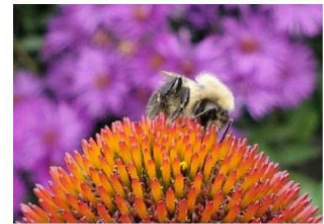
A sleepy bumble bee on a Coneflower.