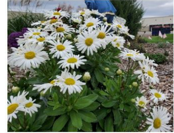
The Shasta Daisies are still going strong in October.