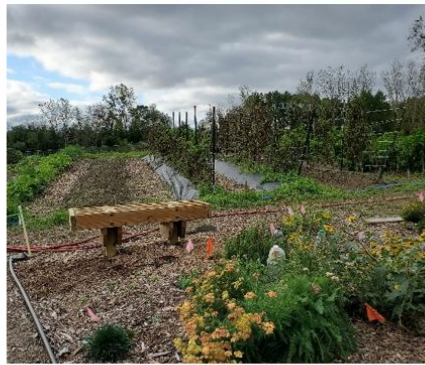
The people working on the Gleaners Victory Garden appreciate the benches...and the beautiful view...when they need to take a break.