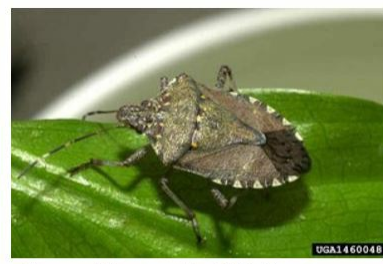
Brown Marmorated Stinkbug