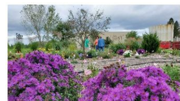
Mounds of purple asters really add a pop of color.

After much work last Fall - digging (salvaging plants from old Victory Garden to winter over), cleaning (took plants to “bare root”), fertilizing (cow manure), and clearing (we mowed and buried the entire old VG under cow manure, dense cardboard and 4 inches of wood chips), we at last put the Old Victory Garden to bed, and welcomed our team back to the “New Victory Garden” in May 2021 to begin planting many perennials intended