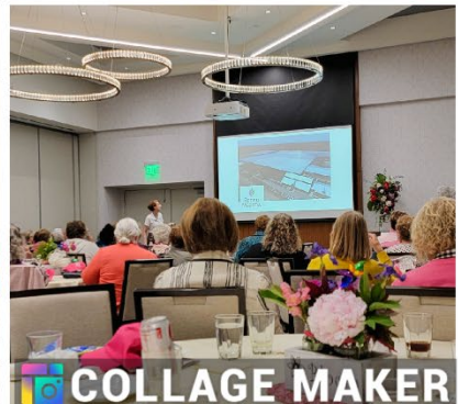
Thursday Conference: Annual Meeting and Awards, Keynote Speaker.