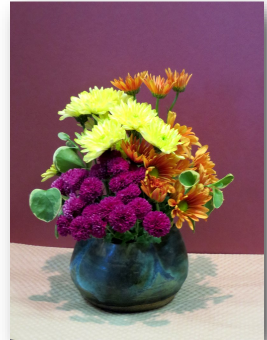
Grouped mass design