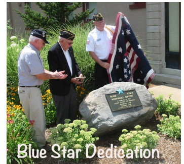
Blue Star Dedication

Recently, flowering trees were donated and planted in a city park, at the Habitat for Humanity house, and for Arbor Day (Earth Day). The club helped raise over $8,000 to repopulate the city with American Liberty Elm trees.