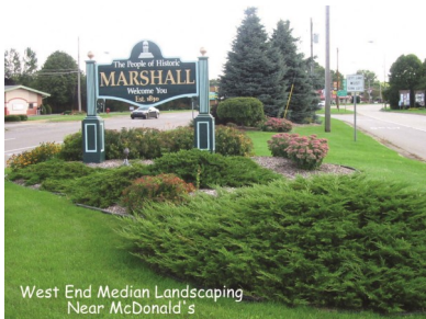
West End Median Landscaping Near McDonald's

Most recently, the club totally revamped the West End Gardens and took over the design and planting of the city of Marshall's 16 large downtown urns. As is the case with the Fountain Circle flowers, funding for the flowers for the downtown urns is provided by the city with club members doing the design and planting. Funding for most of our projects comes from our membership dues and our highly successful "Welcome to My Garden" annual tour held the second full weekend of July. This tour is the club's major fundraiser and this year's tour will be the club's 28 th annual tour (see article on page 8).