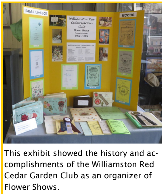
This exhibit showed the history and accomplishments of the Williamston Red Cedar Garden Club as an organizer of Flower Shows.