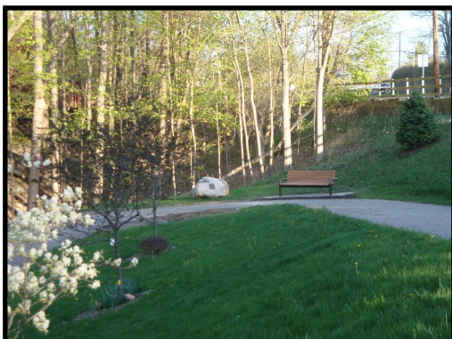
A portion of the Memorial Tree Walkway with Dedication boulder and newly installed bench.

Grand Ledge Garden Club has received awards for their Memorial Tree Program in the categories of 'Civic Beautification', 'Civic Achievement' and "Landscape Design". The awards are judged by the standards as defined by the National Garden Clubs, Inc. and Michigan Garden Clubs, Inc. for outstanding contributions to local communities.