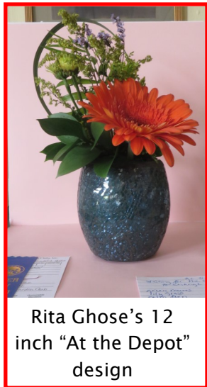
Rita Ghose's 12 inch "At the Depot" design