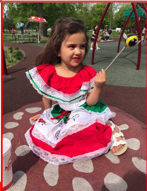
This happy customer purchased her IJB bee at the Meridian Garden Club Plant Sale.