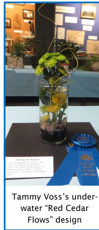
Tammy Voss's underwater "Red Cedar Flows" design