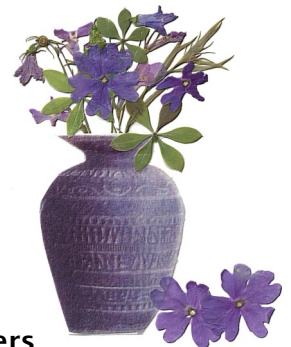
Pressed flower designs made by Meridian Garden Club members