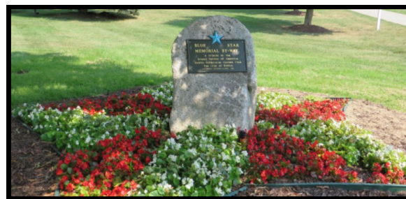
DeWitt Millennium GC September 10, 2008