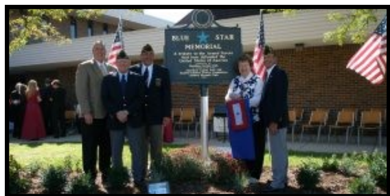
Meridian Garden Club September 27, 2008